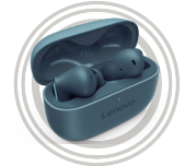
Lenovo TWS YOGA PC Edition