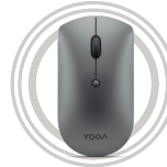
Lenovo Yoga Slim Mouse